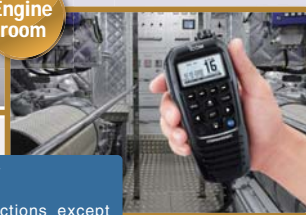
HM-229B/W Controls most of functions except Distress operation from up to 18.3 m.